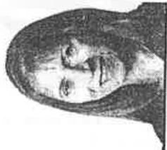
On The Move